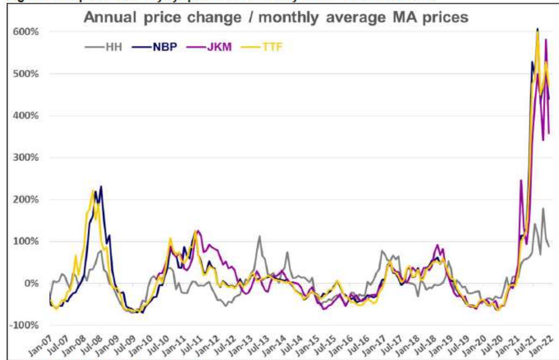
Figure 4: Unprecedented yr/yr price rise: January 2007 – December 2021

Present & going forward: permanent price competition with Asia/Latin America