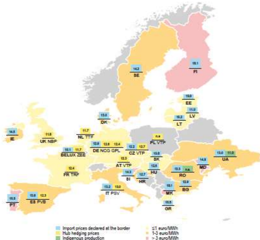
Figure 18: 2020 estimated average suppliers' gas sourcing costs by MS and EnC CP and delta with TTF hub hedging prices – euros/MWh